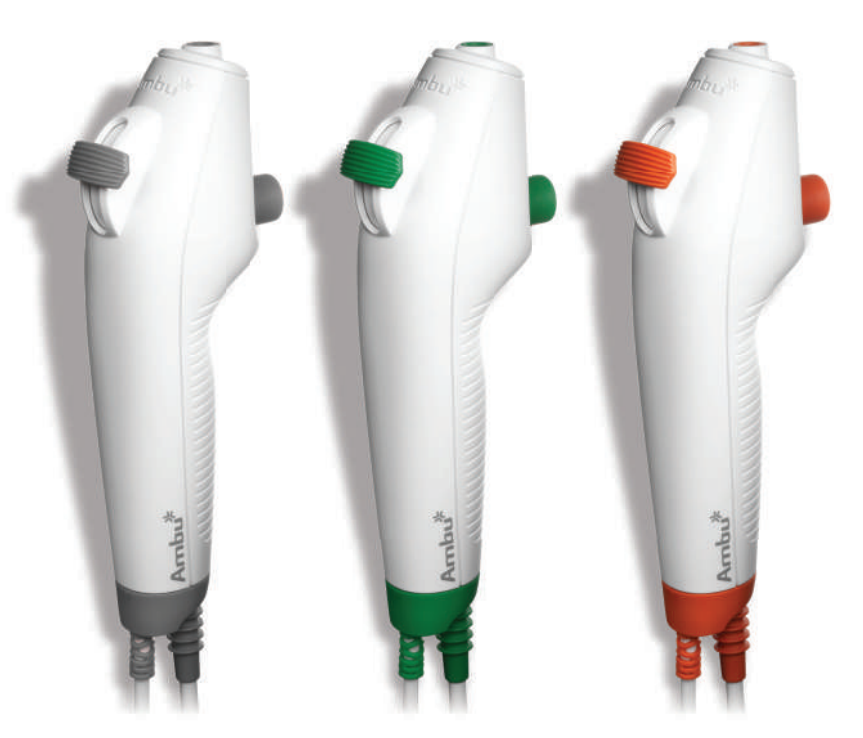
aScope 4 Broncho Slim 3.8/1.2 180°/180°

Includes three sizes for multiple procedures and the aScope BronchoSampler, a tailor-made solution that helps simplify the sampling process